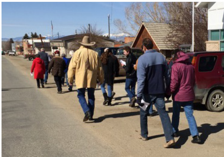
Good Friday Stations of the Cross Walk

shared Grief Support Group. While neither church has the resources alone to provide Sheridan with this ministry of compassion, the two churches pooling their resources together, with the help of a professional counselor, are beginning this offering in April at the Methodist Hall.